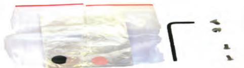
Foil Service Kit 4733/4794. PSt 3