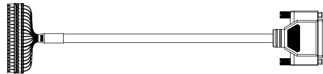
Figure 2: 8B Backpanel Interface Cable